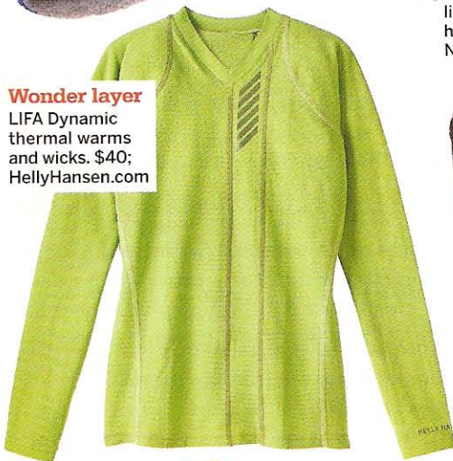
Wonder layer LIFA Dynamic thermal warms and wicks. $40; HellyHansen.com