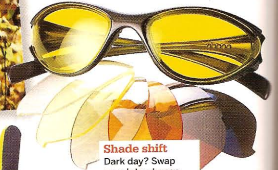
Shade shift Dark day? Swap your Interchange lenses. $100 and up; NikeVision.com

When the weather gets tough, the tough get all-weather workout wear.