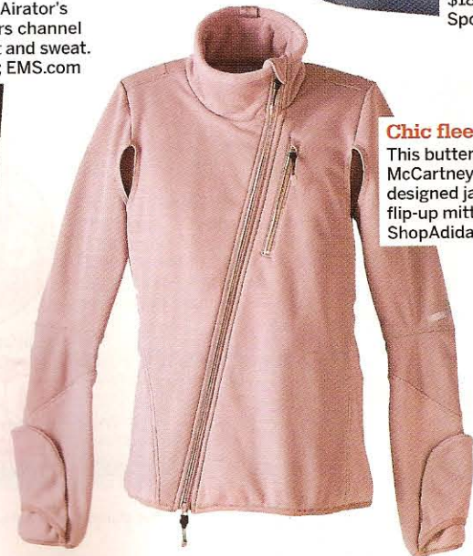
Chic fleece This buttery Stella McCartney-designed jacket has flip-up mitts. $300; ShopAdidas.com