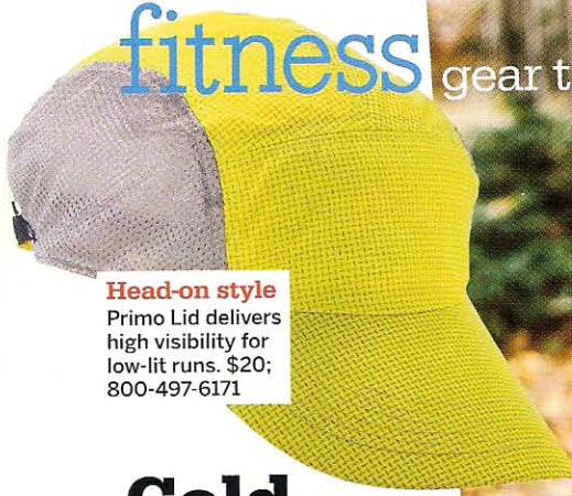
Head-on style Primo Lid delivers high visibility for low-lit runs. $20; 800-497-6171