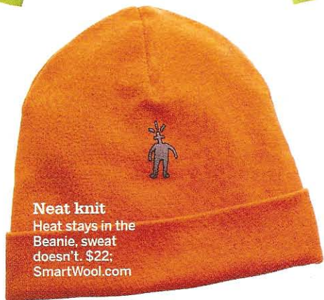
Neat knit Heat stays in the Beanie, sweat doesn't. $22; SmartWool.com