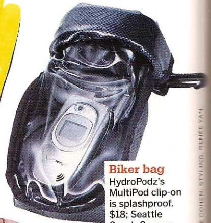
Biker bag HydroPod's MultiPod clip-on is splashproof. $18; SeattleSportsCo.com