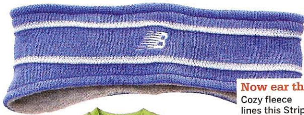
Now ear this Cozy fleece lines this Striped headband. $15; NewBalance.com