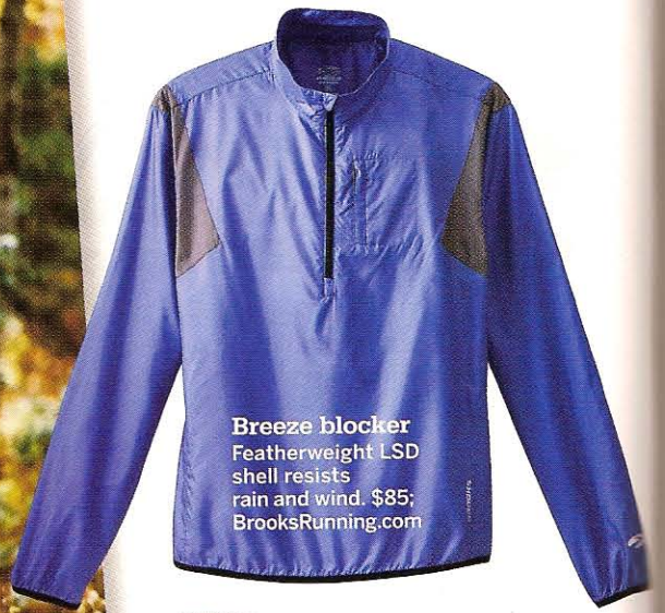
Breeze blocker Featherweight LSD shell resists rain and wind. $85; BrooksRunning.com