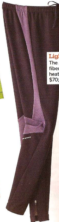
Light tights The Airator's fibers channel heat and sweat. $70; EMS.com