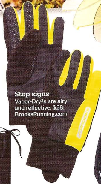
Stop signs Vapor-Dry's are airy and reflective. $28; BrooksRunning.com