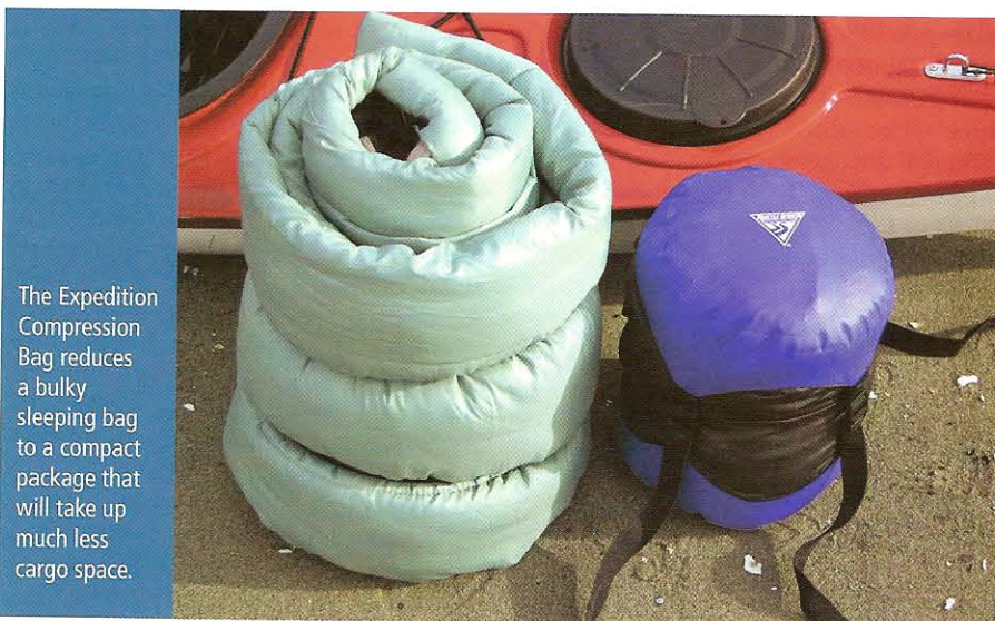
The Expedition Compression Bag reduces a bulky sleeping bag to a compact package that will take up much less cargo space.

To test the bag, I filled it with a synthetic three-season sleeping bag that left about 10 inches unused at the top of the dry bag. With the top prepared for closure, I "burped" the bag down with my knees and achieved about a 50-percent reduction in size. Once the top was buckled shut, I put all my weight on the bag and reduced it down perhaps another 10 percent through the purge valve. Finally, I pulled the end-cap over the top and started reefing the