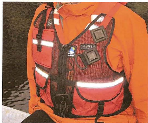
The Guide Vest adds carrying capacity, versatility and visibility to any PFD.

Despite the extra weight of the gear, any sense of having added another layer is cancelled out by the overall fit of the vest and evenly distributed pockets. The generous cut of the armholes kept the