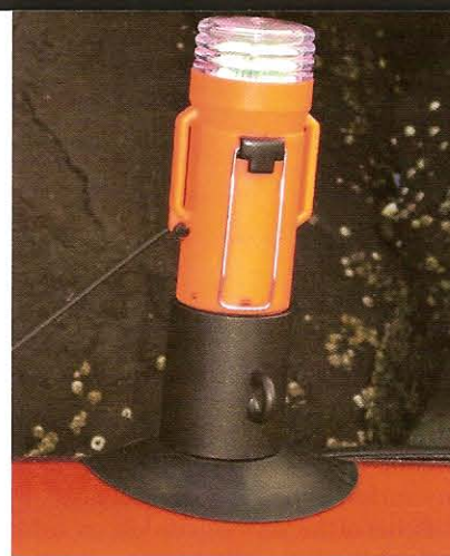
The MultiStrobe can be used as a flashlight or, with its suction-cup base, as a deck light.

The MultiStrobe is powered by four AAA batteries and uses nine LED bulbs: three white, three red and three green. (Though the "strobe" part of the name suggests extremely brilliant and short bursts of light, LEDs do not function that way.) It has five settings: white light in