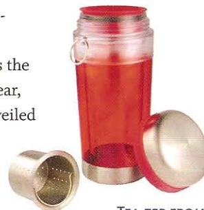
TEA-ZER FROM PACIFIC CORNETTA

The popularity of home-improvement projects continues to soar across the country. New for this year, Black & Decker has unveiled the SmartDriver cordless screwdriver ($39.99; www.blackanddecker.com ) with a lithium