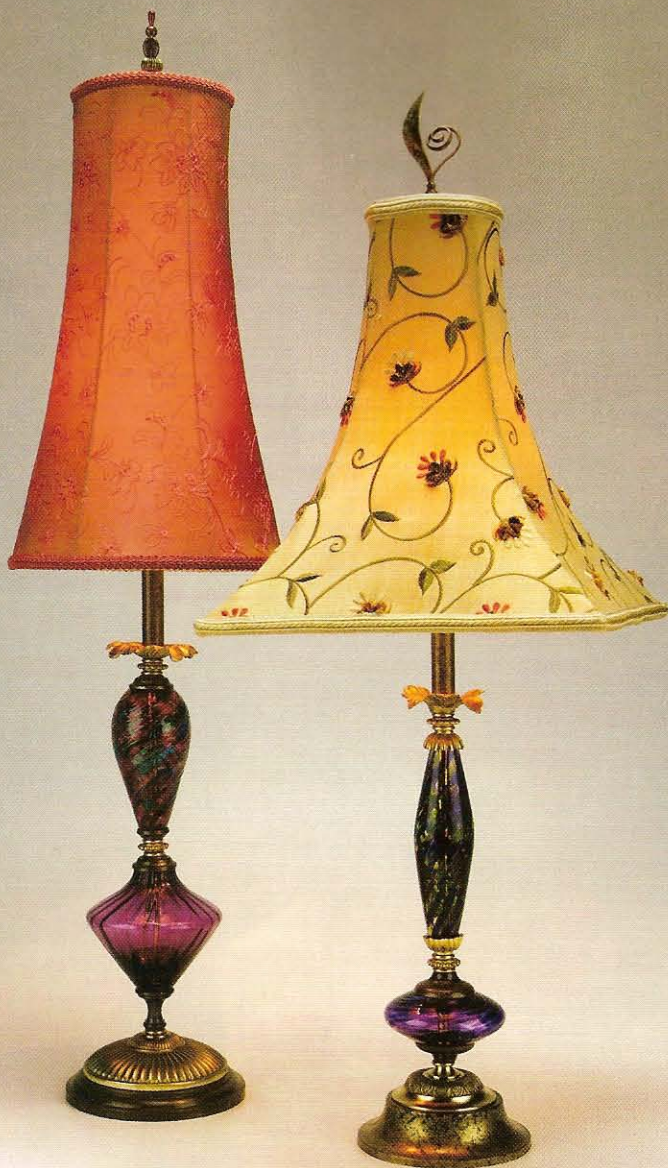
LAMPS FROM KINZIG DESIGN

Malibu Two XL ($679) from Ocean Kayak and the one-seat Tsunami 140 ($925) from Wilderness Systems that have everyone excited.