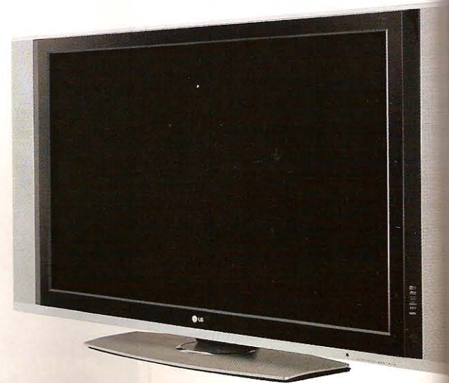
LG ELECTRONICS' 42P

On the subject of gifting, that age-old proverb had it right. It's always better to give than to receive. And holiday time means gifts for everybody, an annual ritual that even the Scrooges among us have to like. With that in mind, we present a sampling of this season's best and our predictions for which gifts will give your loved ones reason for joy at year's end.