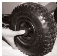
push axle through