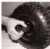
press down to clear wheel hub