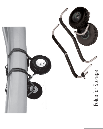
Folds for Storage

The wheels should be on the outside of the frame. Notice that the wheels are centered inward. This distributes heavy loads and reduces "drag" when pulling the boat.