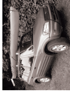
Deluxe 16" No-Skid Kayak Kit