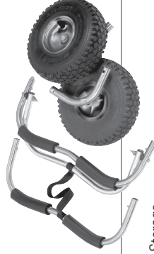
Folds for Storage