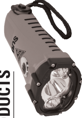
SUB Submersible Utility Beam™